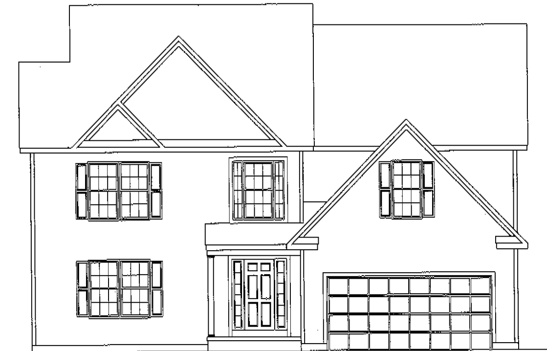
FRONT ELEVATION CAMBRIDGE