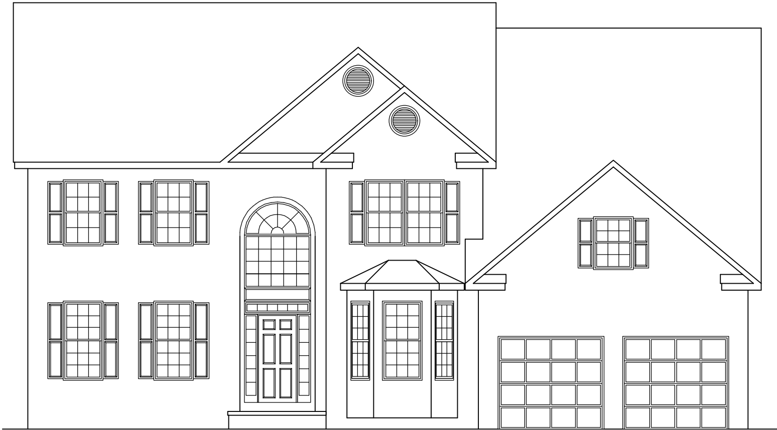
FRONT ELEVATION CHARLESTON