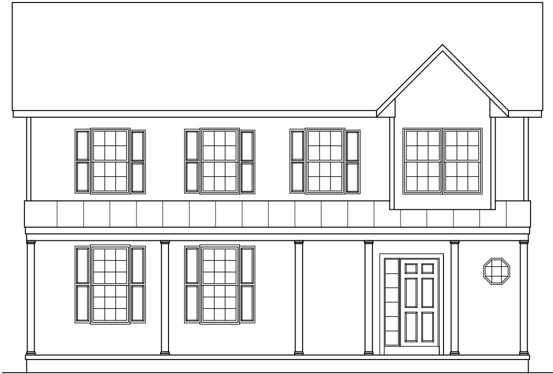
FRONT ELEVATION HEATHER LANE